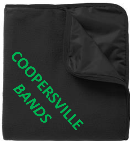
Port Authority® Fleece & Poly Travel Blanket