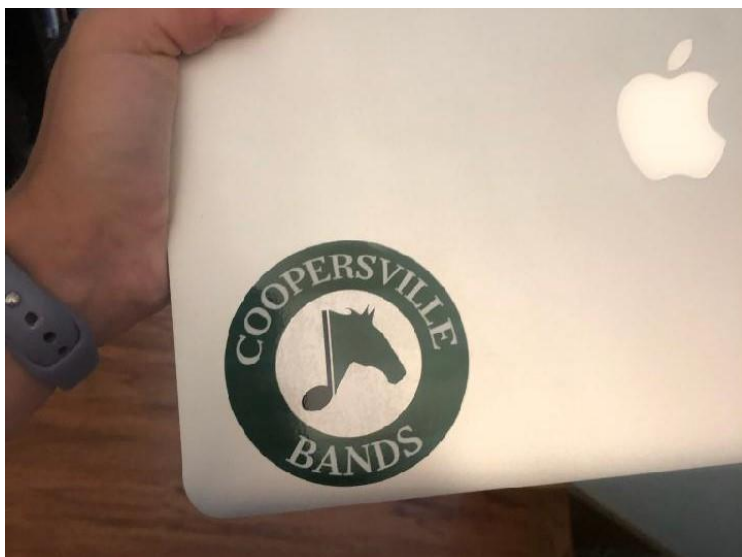
Clear Stickers – for vehicles, laptops, waterbottles, etc.