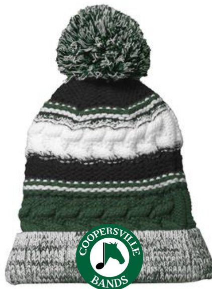
Sport-Tek® Pom Pom Team Beanie