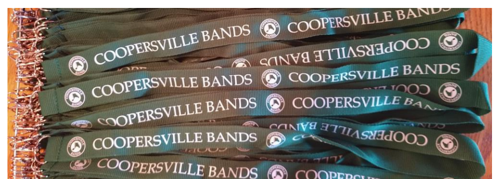
Coopersville Bands Lanyard Band Logo