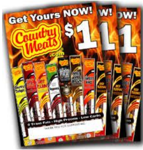
Country Meats Smoked Snacks

Cash and Checks Accepted. Credit cards accepted at concerts only.