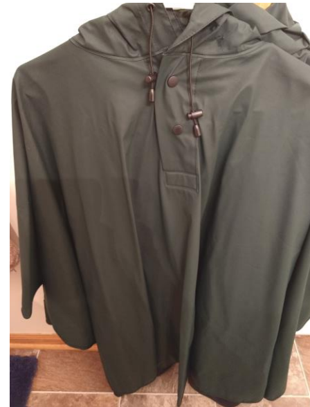
Retired Marching Band Rain Ponchos